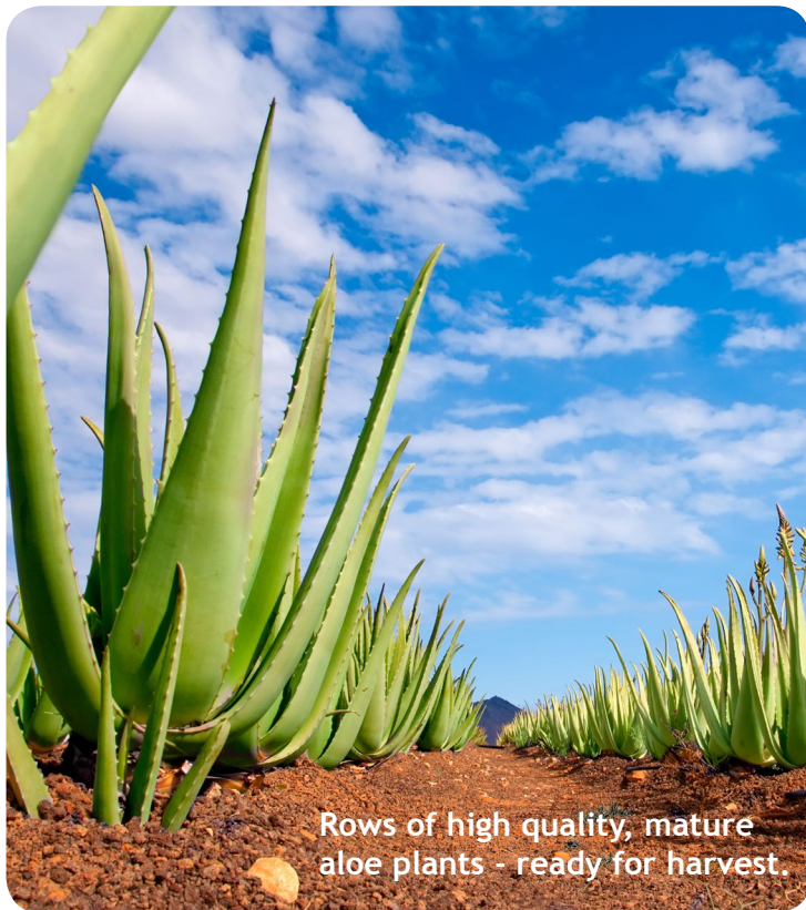
Rows of high quality, mature aloe plants - ready for harvest.